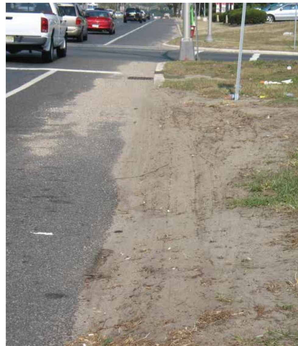
INCOMPLETE BUS STOP