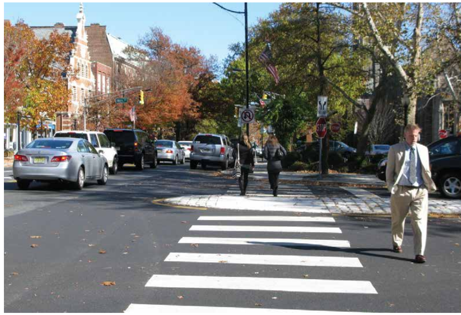
COMPLETE THE CROSSING