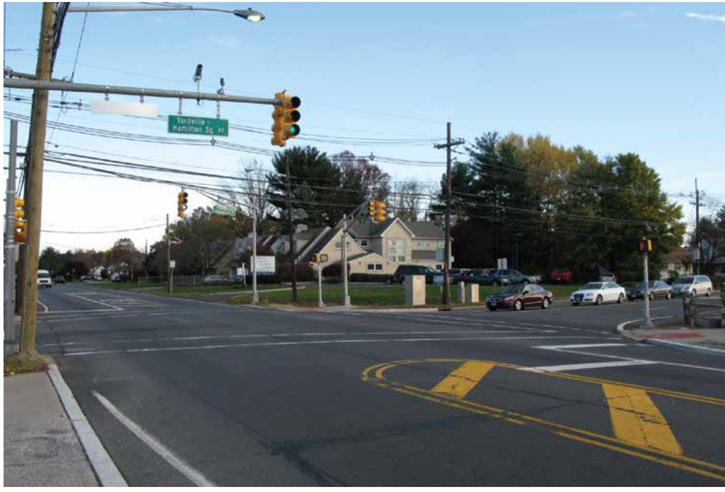
BUSY FOUR LANE HIGHWAY