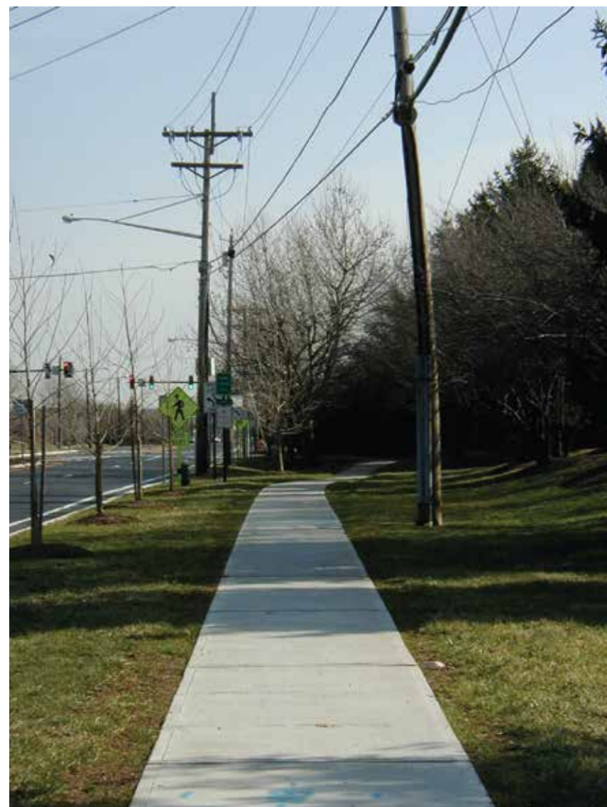
FILLING THE GAP