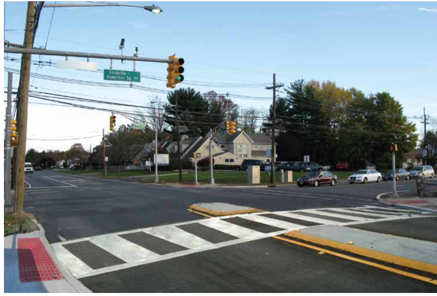
REFUGE SHORTENS THE CROSSING DISTANCE