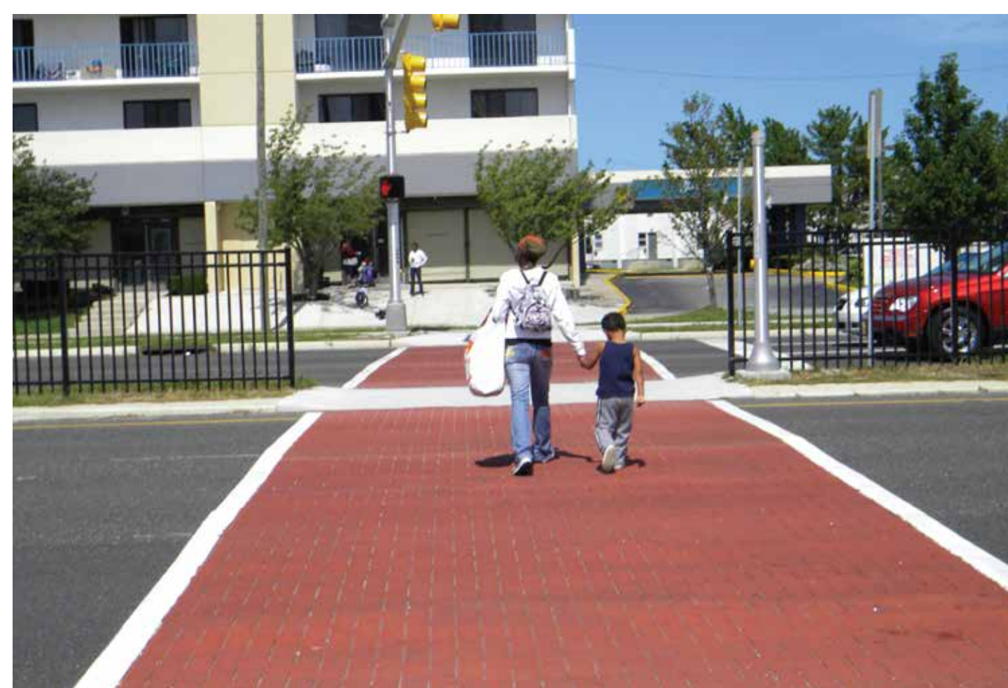
INSTALL A TRAFFIC SIGNAL & CROSSWALK